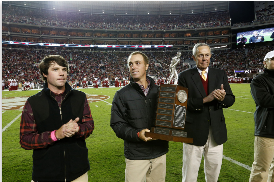
Justin Thomas receiving the 2012 Haskins Award at the University of Alabama.

Presenting Sponsor Stifel Financial Corporation